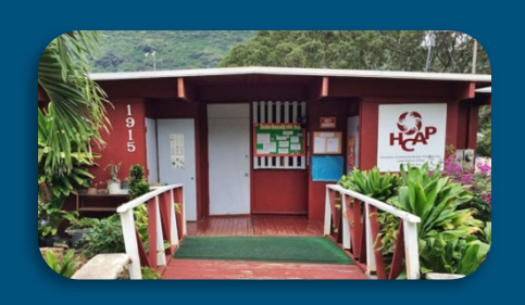
Leahi District Service Center